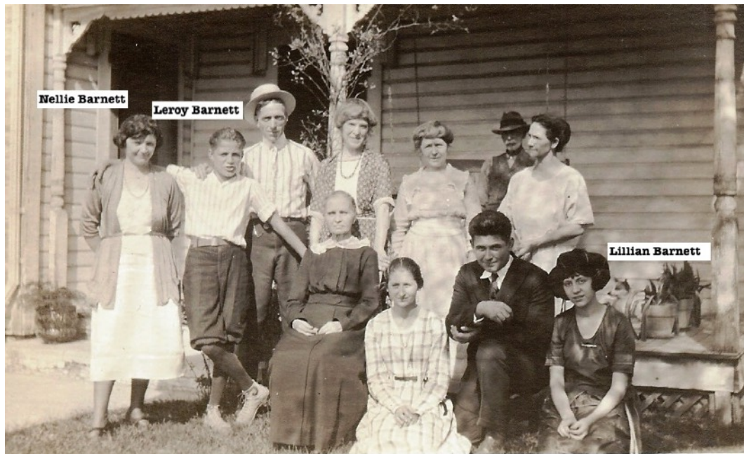
ABT. 1918, NORTH LEWISBURG, CHAMPAIGN, OHIO