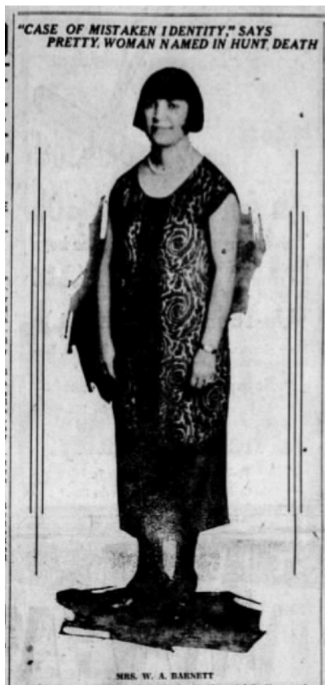
THE MARION STAR, MAY 26 1925