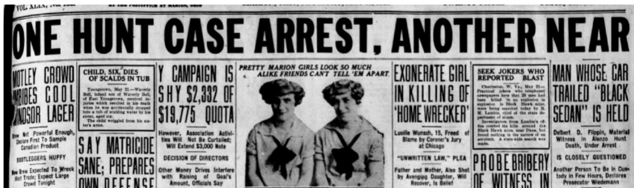
THE MARION STAR, MAY 21 1925